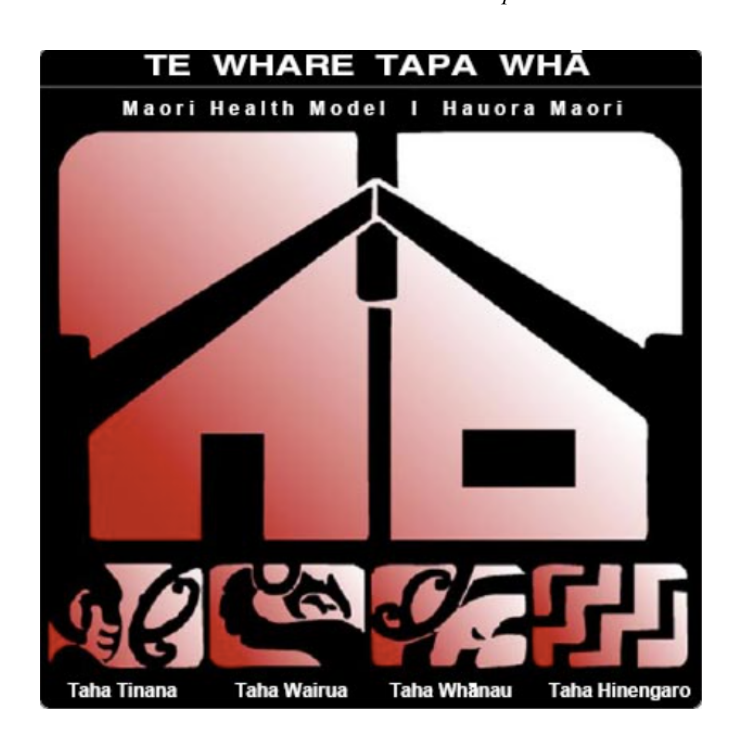
Figure 1: Te Whare Tapa Whā model (Durie, 1998) https://www.health.govt.nz/our-work/populations/maori-health/maorihealth-models/maori-health-models-te-whare-tapa-wha

Other Māori health models including the Meihana model (Pitama et al., 2007) and Te Wheke (Pere, 1982; Pere & Nicholson, 1991) are adopted across the literature (Pere & Nicholson, 1991; Pitama, Huria, & Lacey, 2014), typically when researching Māori by Māori researchers. However, this research project focuses on using Te Whare Tapa Whā to analyse and interpret the data for a holistic perspective on health.