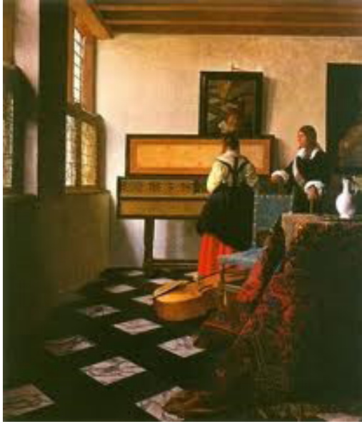
Figure 3. Johannes Vermeer, The Music Lesson (c 1662-65).

the observer to trace the projected image onto paper placed on the screen. It also meant that, on a larger scale, an artist could sit inside the chamber and draw the image onto paper placed on the back wall, or stand outside the chamber to trace it onto an opaque screen mounted on the rear wall. These types of cameras were widely used as an aid to drawing.