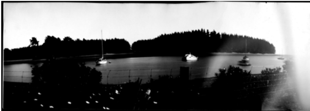
Figure 6. Michael Potter; photograph of Mapua channel taken with a concave back pinhole camera.

My hope was that each lens would expose one quarter of the paper inserted, and therefore create a panoramic image that merged one scene into the next, with horizons that bent in towards each other near the centre of the image, as in Figure 5. The horizon lines are distorted due to the paper sitting on a convex surface. This particular camera had two main uses: taking four shots of the same scene by turning the camera around on its turntable bearing, and taking 360° panoramas. For most of my ceramic cameras, I have used local ash glazes fired to cone 10 in reduction. This is the opposite of the effect one would expect in a biscuit tin – very drippy, with bare patches and rough textures from the seaweed glaze (as seen in Figure 4).