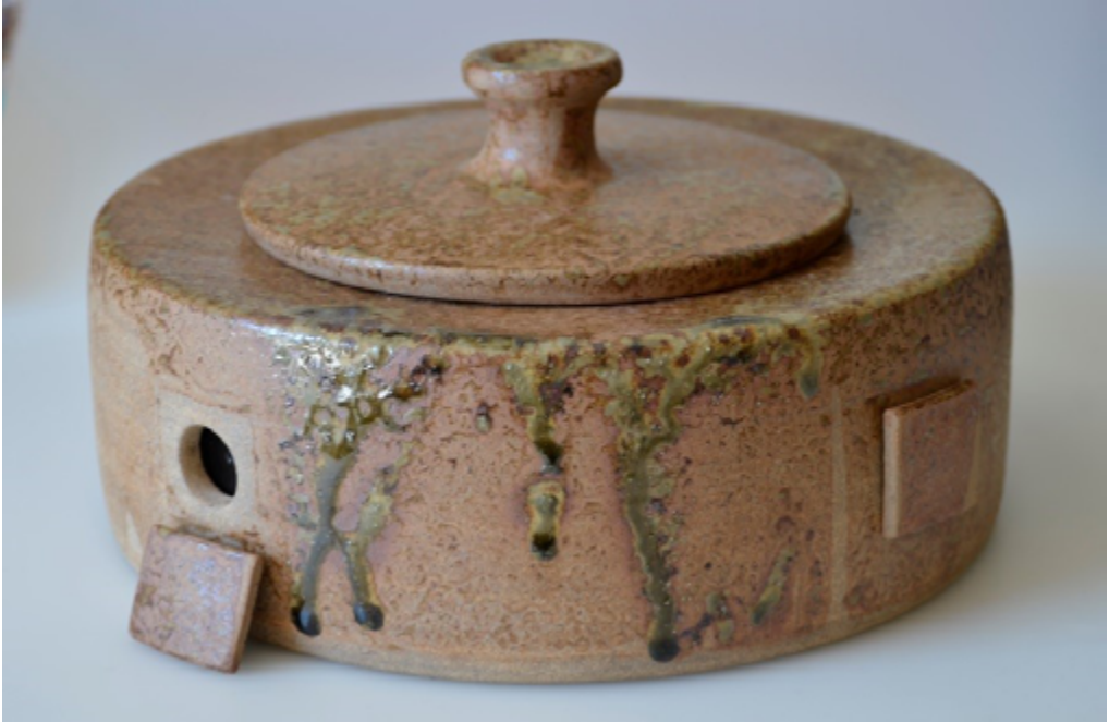
Figure 4. Michael Potter; circular ceramic pinhole camera.

a vested interest in maintaining the credibility of the art world were unwilling to see the reputation of some of the world's most famous artists undermined. However, many art experts have been concerned to refute the arguments put forward against the use of optics in these paintings.