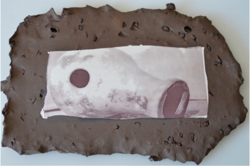
Figure 7. Michael Potter; decal applied to ceramic tile. Photograph of an Udu drum taken with a ceramic pinhole camera.

For this camera, I devised a lid with an additional rim set about a centimetre in from the outside wall; this rim acts as a light trap when it sits over the raised rim of the camera body. This camera has a very organic shape, with a smooth apple ash glaze complemented by a small scallop shell fitted as a 'lens cap' – all the cameras need something to cover the pinhole before and after exposure. The pinhole itself is in a piece of tin can glued to the inside of the camera. I have solved the problem of holding the cap in place by using magnets glued to the back of the cap that stick fast to the tin pinhole shim. Traditionally, black masking tape is used for the cap and also around the opening.