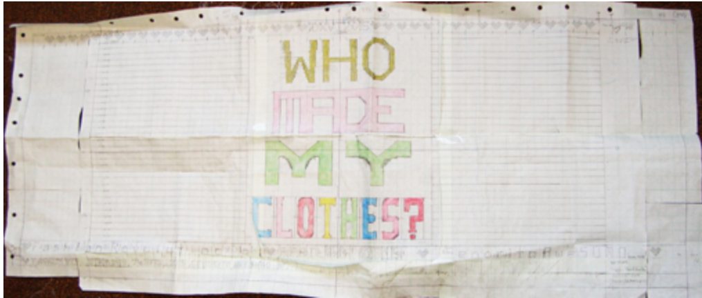
Figure 9 Working pattern for korowai.