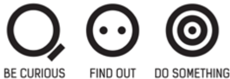
Figures 2-5. Be Curious, Find Out, Do Something! A call to action to all consumers from Fashion Revolution Day.