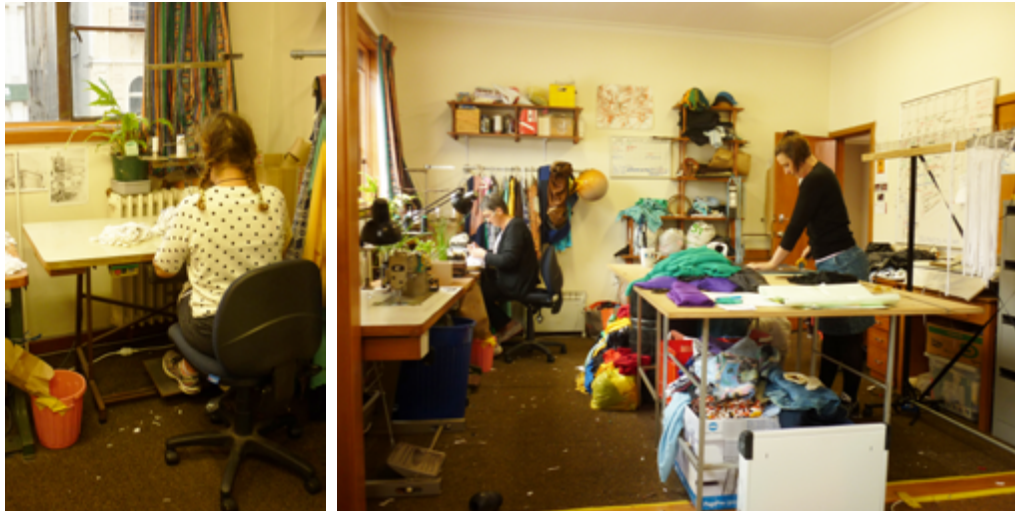
Figure 10 and 11. A community made this: friends and whanau cutting and sewing t-shirt strips.