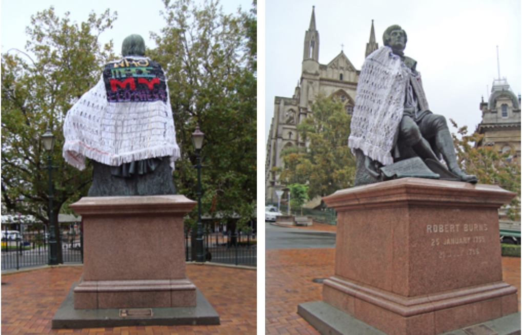
Figure 6-8. Taniko weave in the cloak rear of Robbie Burns' statue and as viewed from front and side.