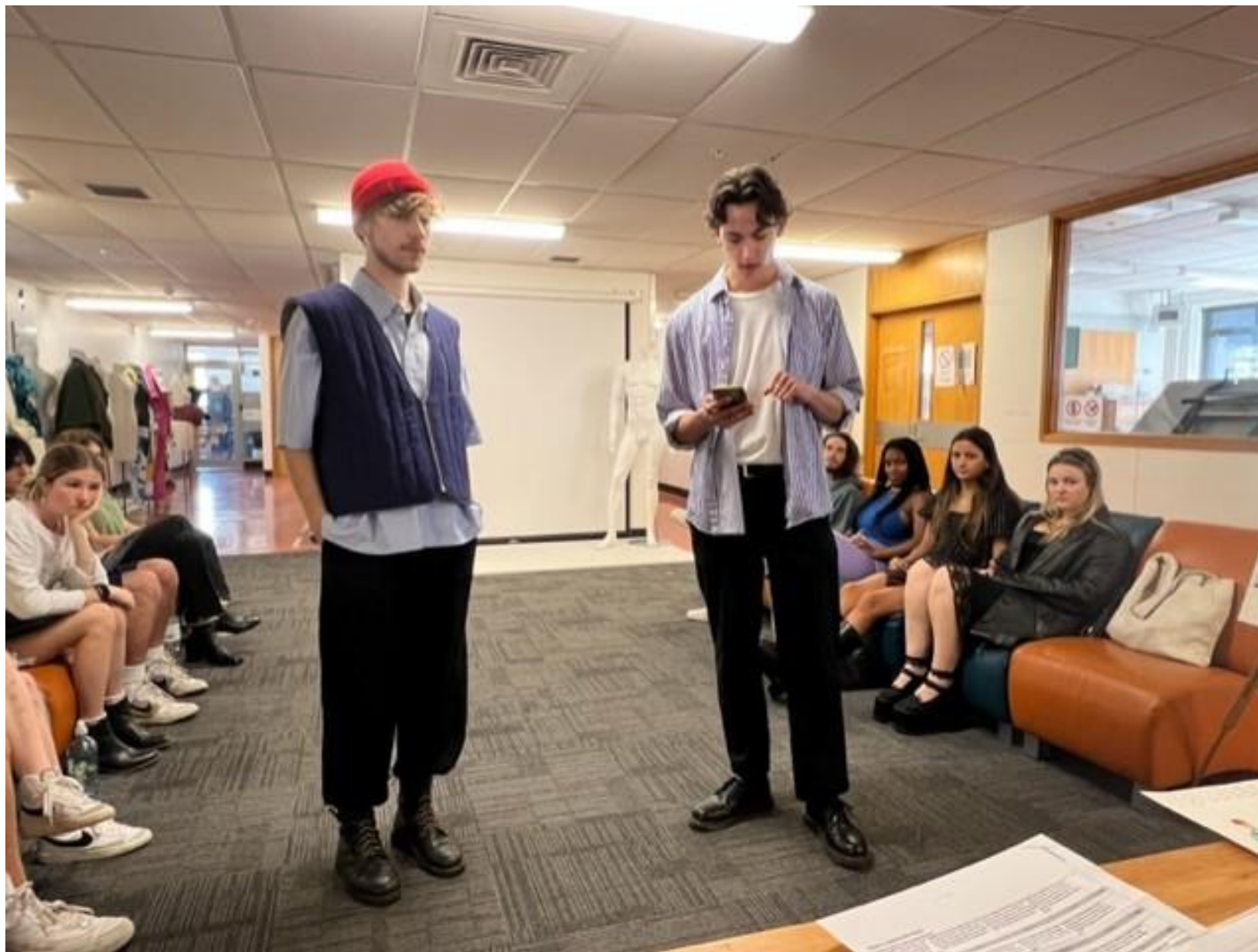
NZ Certificate in Fashion (Level 4), Fashion Design Project, Presentations. 2021