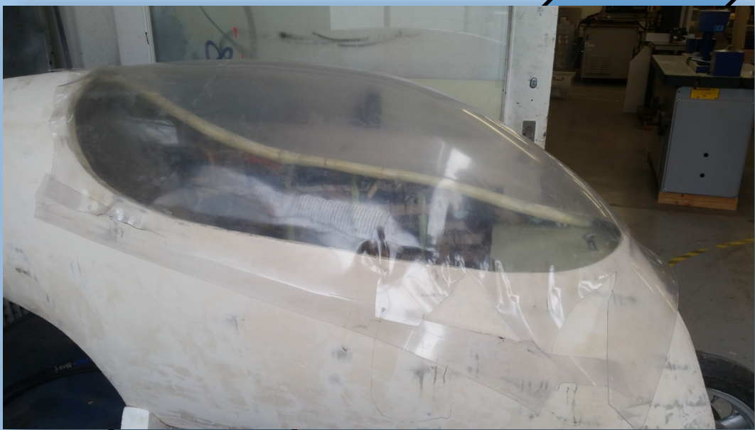
Trimmed to fit